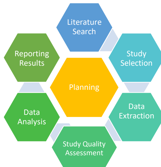
Figure 1. Stages of the Systematic Literature Review Method

The final stage is reporting the results, which involves presenting the analysis and synthesis of the data in a systematic narrative. Reporting the results aims to provide a clear picture of the effectiveness of the role-playing learning method.