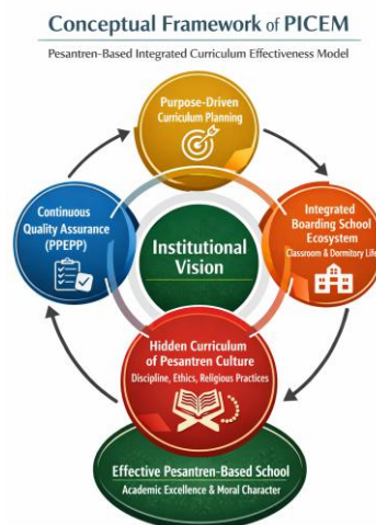
Figure 2. Conceptual Framework of PICEM

From a theoretical perspective, the PICEM model contributes to the literature on curriculum management and educational effectiveness by introducing a culturally embedded framework for understanding how Islamic boarding schools achieve educational excellence. Previous research on pesantren modernization often highlights the need to adapt traditional institutions to contemporary educational challenges (Abidin, 2020; Hakim et al., 2025). The present model suggests that such modernization does not necessarily require abandoning traditional educational values. Instead, educational transformation can occur through adaptive curriculum management that integrates modern quality management principles with pesantren cultural traditions.